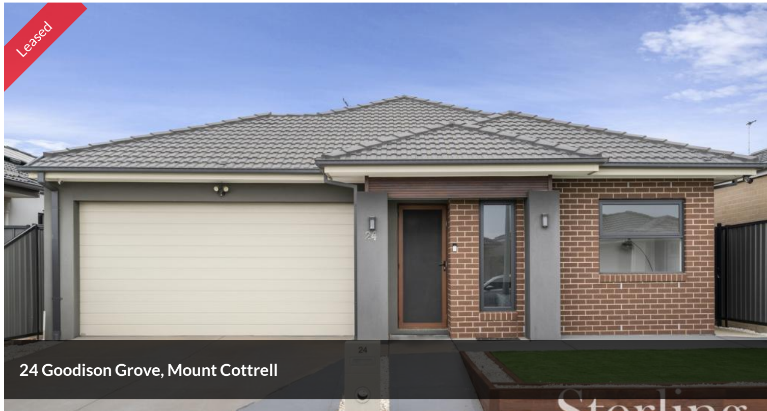
24 Goodison Grove, Mount Cottrell