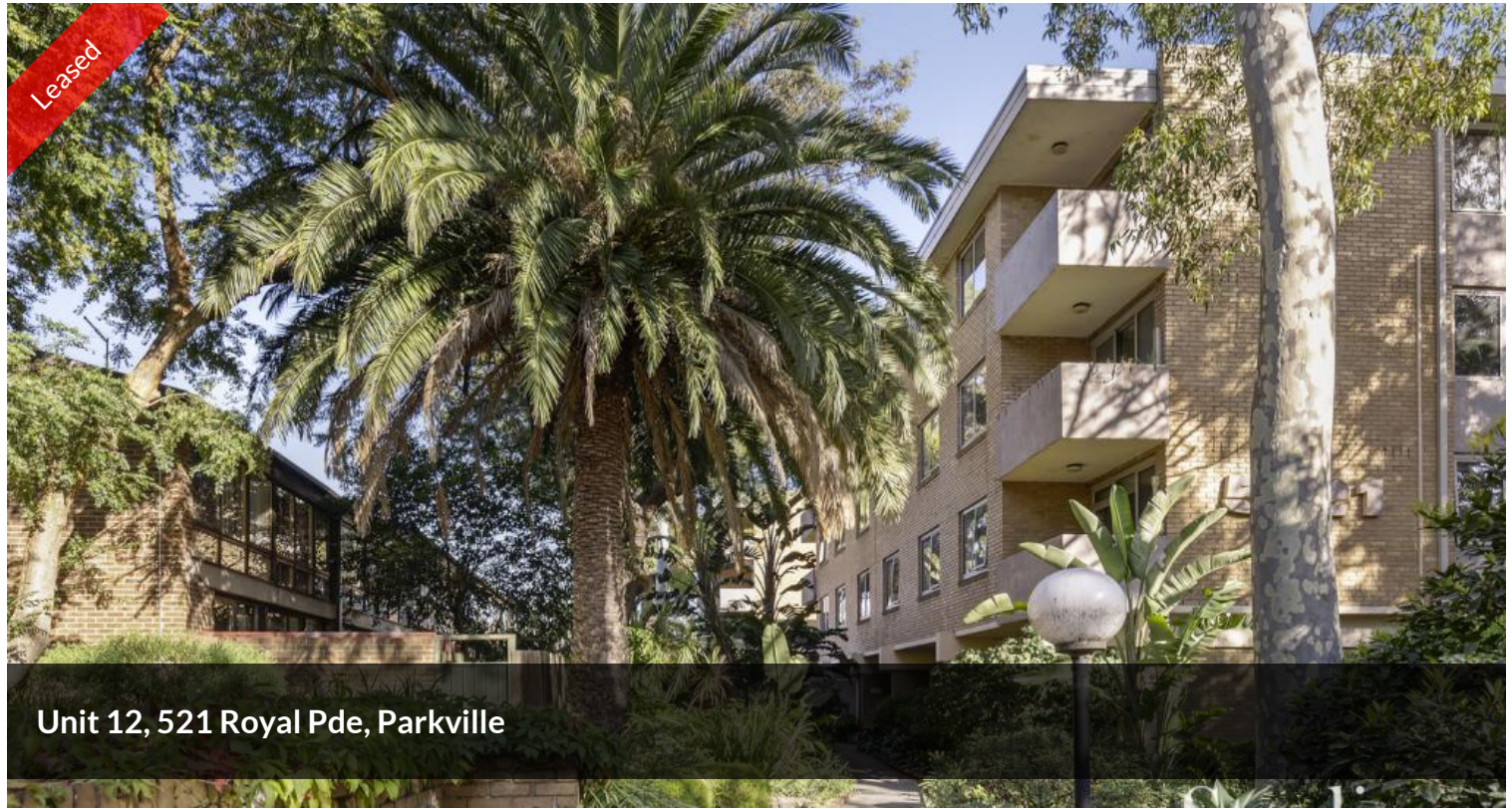
Unit 12, 521 Royal Pde, Parkville