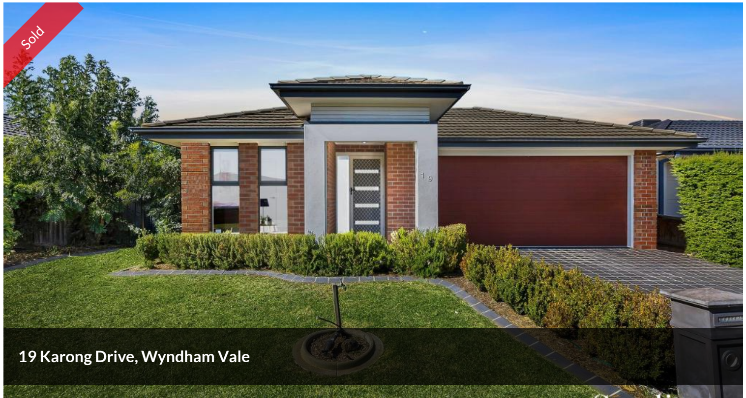
19 Karong Drive, Wyndham Vale