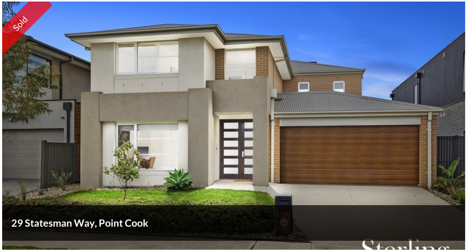
29 Statesman Way, Point Cook